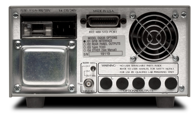
DG535 rear panel (with Opt. 02)